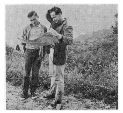
---right here---I think!

coming outing. On November 24, the Club will go on a fishing trip to Malibu to fish from late afternoon until dark. December 22 will be a surprise outing. On January 26th, the boys have scheduled a snow outing, pending on the weather conditions.