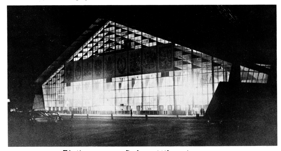
Blyth arena -- So long 'til next year.

We could see just a part of the beautiful garden that God has given (cont. on page 4)